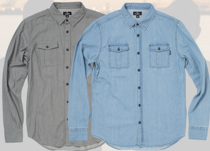
AL1468 AUGUST GREY / INDIGO 100% COTTON TWILL W/ HEAVY WASH $26 / $54