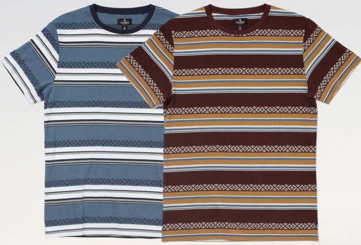
AL1118 CHASE BLUE / BURGUNDY JACQUARD STRIPE 60/40 COTTON / POLY $18 / $38