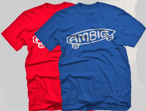
AL2070 BORED RED / ROYAL HEATHER $8 / $18