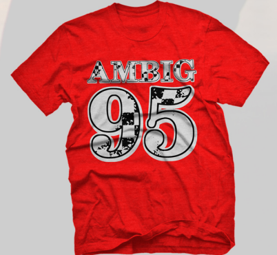
AL2072 CHECKERS RED $8 / $18