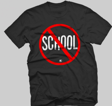
AL2075 NO SCHOOL BLACK $8 / $18