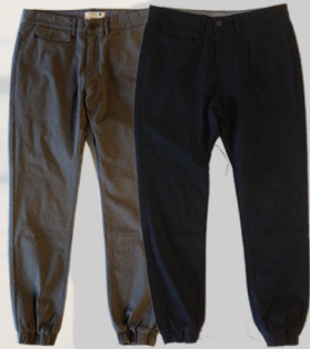
AH1770 OLSON JOGGER NAVY / HEATHER GREY / BLACK S/T TWILL $30 / $62