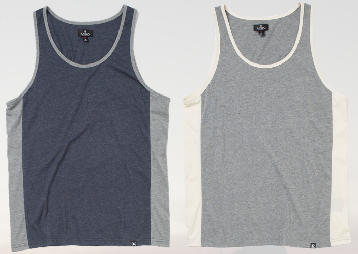
AL1113 JAMIE NAVY / GREY SINGLE DYE JERSEY 60/40 COTTON / POLY $13 / $28