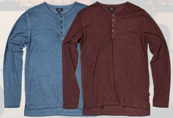
AL1222 CARSON BLUE / BURGUNDY 100% SLUB COTTON W/ DIRTY WASH $18 / $38