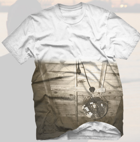
AL1044 DISCO SUCKS WHITE $13 / $28