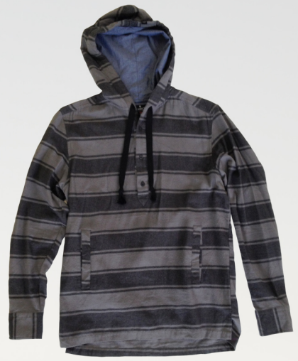
AL1473 EL DORADO BLACK CVC BRUSHED STRIPE $28 / $58