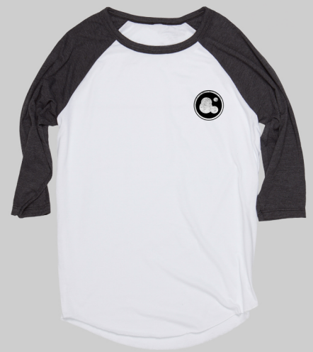
AL1059 BUBBLE RAGLAN WHITE - BLACK $15 / $32