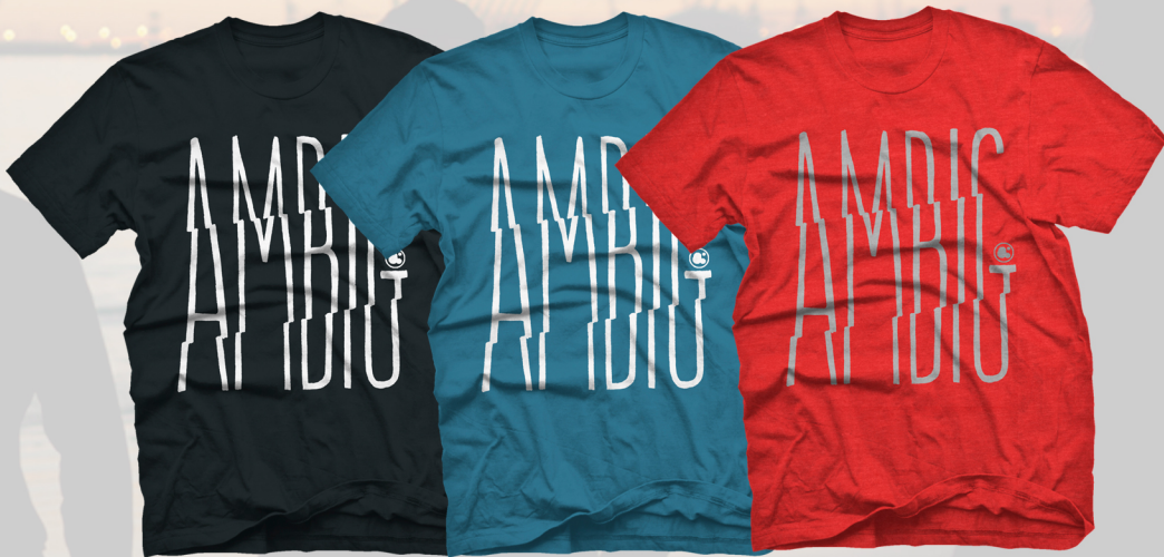
AL1050 FRACTURED BLACK / SLATE / RED HEATHER $11 / $24