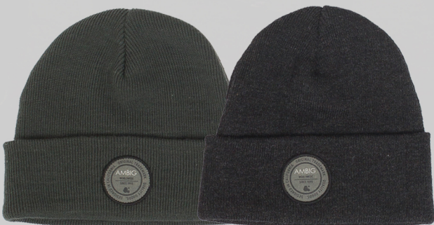
AF1928 SHOOTS BEANIE OLIVE / HEATHER BLACK $9 / $20