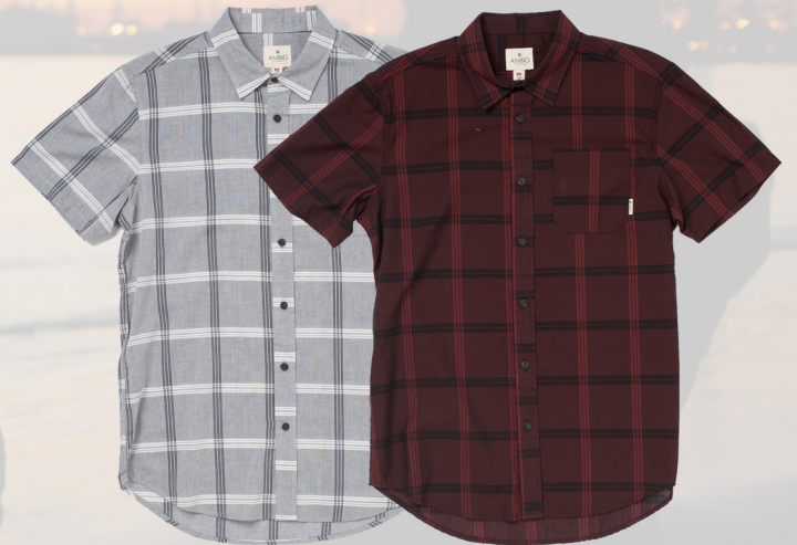
AK1346 BOUCHER BLUE / BLACK CVC Y/D PLAID $22 / $46