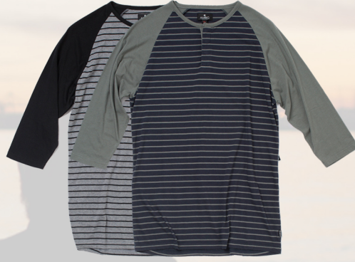
AL2220 LEO GREY / NAVY Y/D STRIPE 60/40 COTTON / POLY $14 / $28