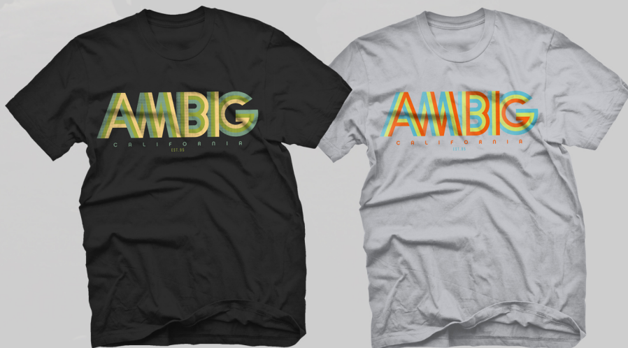
AL1054 RAINBOW BLACK / SILVER $11 / $24