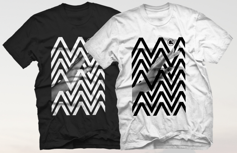
AL1049 HANDSOME BLACK / WHITE $12.50 / $27