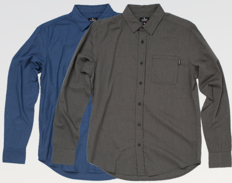
AL2469 LANGE NAVY / GREY HERRINGBONE 100% COTTON $22 / $44