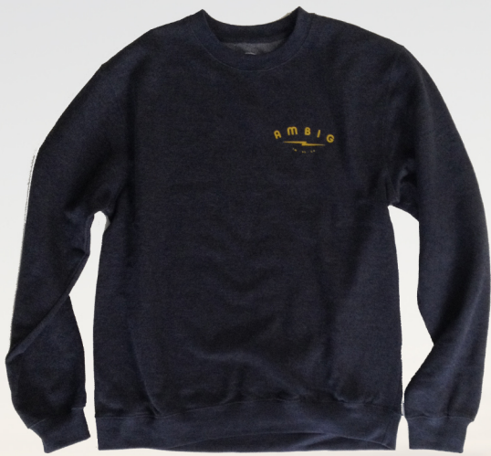
AL1235 BOLT THROWER CREW SWEATSHIRT CLASSIC NAVY HEATHER $25 / $52