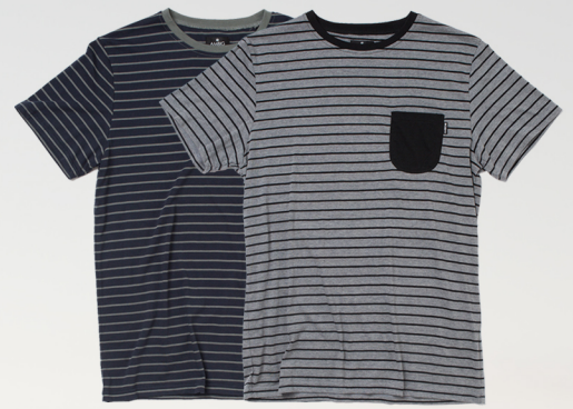
AL2115 EMMETT NAVY / GREY Y/D STRIPE 60/40 COTTON / POLY $14 / $28