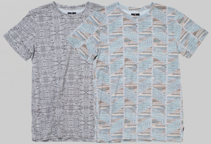
AL1117 LEWIS GREY / BLUE SUBLIMATION 60/40 COTTON / POLY $16 / $34