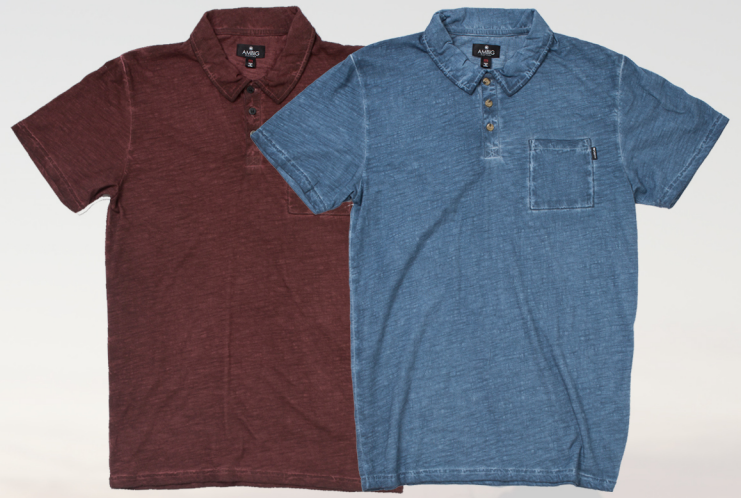
AL1119 HAYDEN BURGUNDY BLUE 100% SLUB COTTON W/ DIRTY WASH $18 / $38