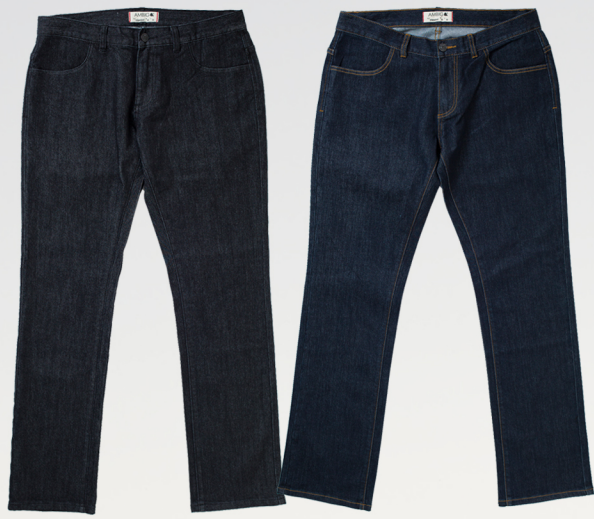
AP1740 DIME STORE STRAIGHT BLACK / INDIGO $28 / $58