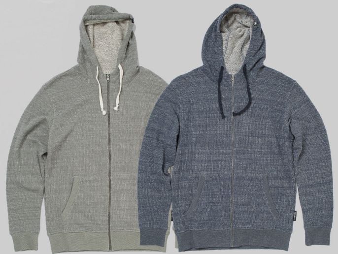
AL1231 DAKOTA GREEN / NAVY FRENCH TERRY 60/40 COTTON / POLY $32 / $66