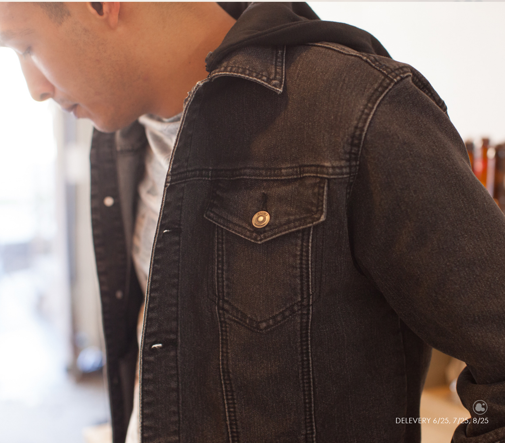
AL1233 LIAM GREY FRENCH TERRY 60/40 COTTON / POLY $35 / $72