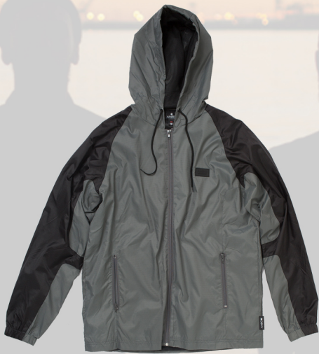
AL1591 ZANDER BLACK 100% NYLON RIPSTOP $36 / $74