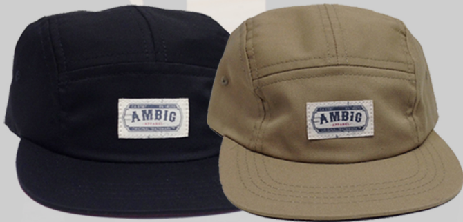
AK9907 LABELED (5 PANEL HAT) BLACK / KHAKI $15 / $32