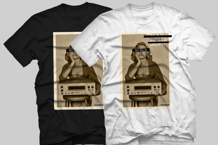
AL1047 SELL OUT BLACK / WHITE $12.50 / $27