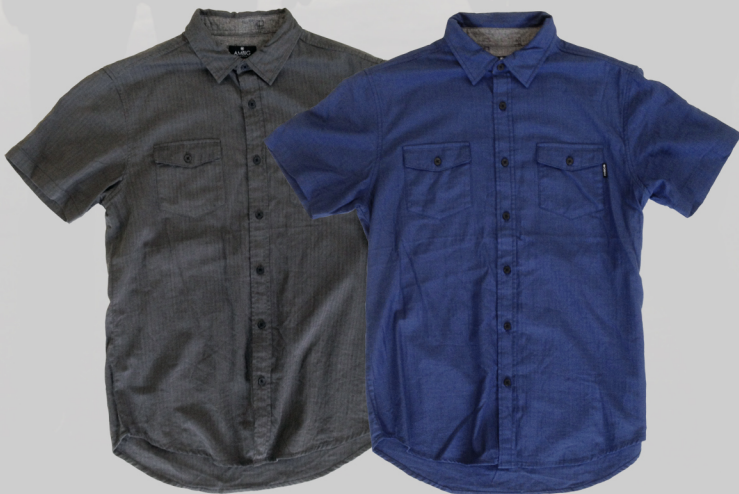
AL1358 RORY GREY / NAVY HERRINGBONE W/ PRINTED OXFORD 100% COTTON $22 / $46