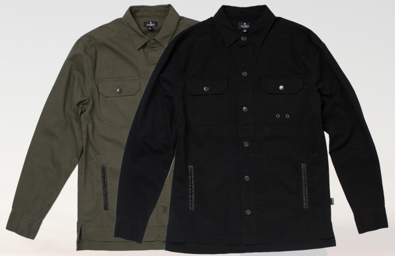
AL1593 PHOENIX OLIVE / BLACK HERRINGBONE W/ PU 100% COTTON $41 / $84