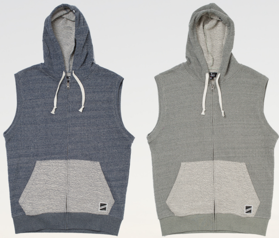
AL1226 ASH NAVY / GREEN FRENCH TERRY 60/40 COTTON / POLY $26 / $54