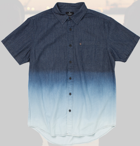
AL1357 SKYE INDIGO 100% COTTON TWILL OMBRE $23 / $48