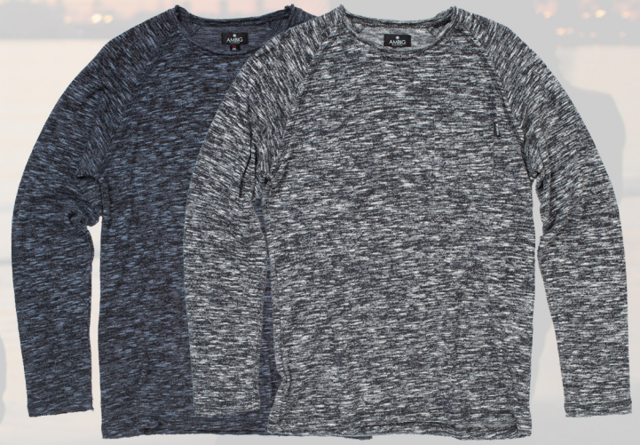
AL1229 PARKER NAVY / BLACK 70/30 COTTON / POLY THICK NEEDLE JERSEY $26 / $54