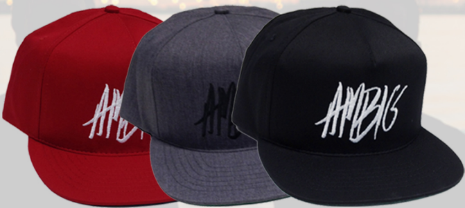
AK9905 SCRIBBLE SNAP BACK RED / HEATHER / BLACK $15 / $32