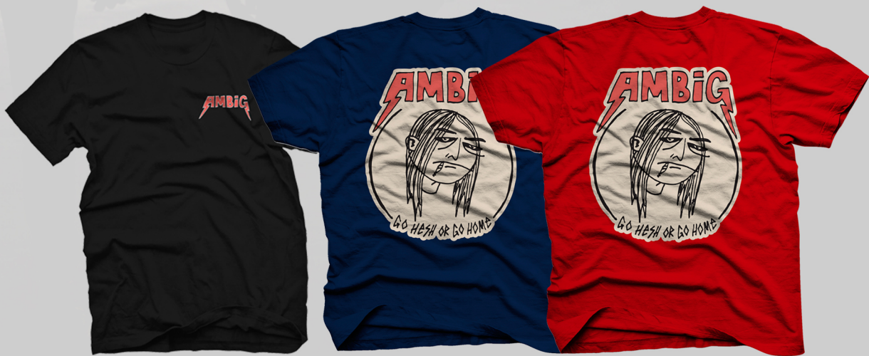
AL1051 GO HOME (BACK PRINT) BLACK / NAVY / DARK RED $12.50 / $27