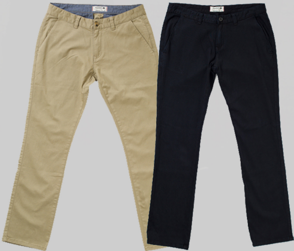
AP1785 STRUMMER STRAIGHT KHAKI / BLACK $30 / $62