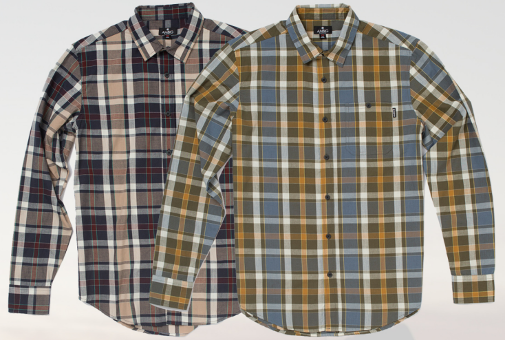
AL1466 BURNS NAVY / OLIVE CVC Y/D PLAID $25 / $52