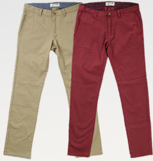
AP1771 PRESSURE DROP GRIPPER NAVY / KHAKI / BURGUNDY SLASH POCKET S/T TWILL $30 / $62