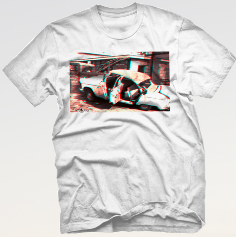
AL1040 ABANDONED WHITE $12.50 / $27