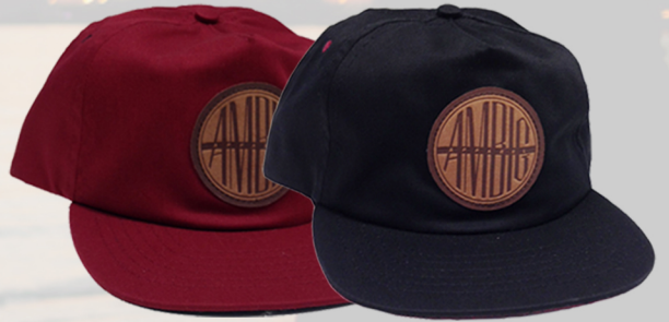
AK9906 ROUNDER SNAP BACK CARDINAL / BLACK $15 / $32