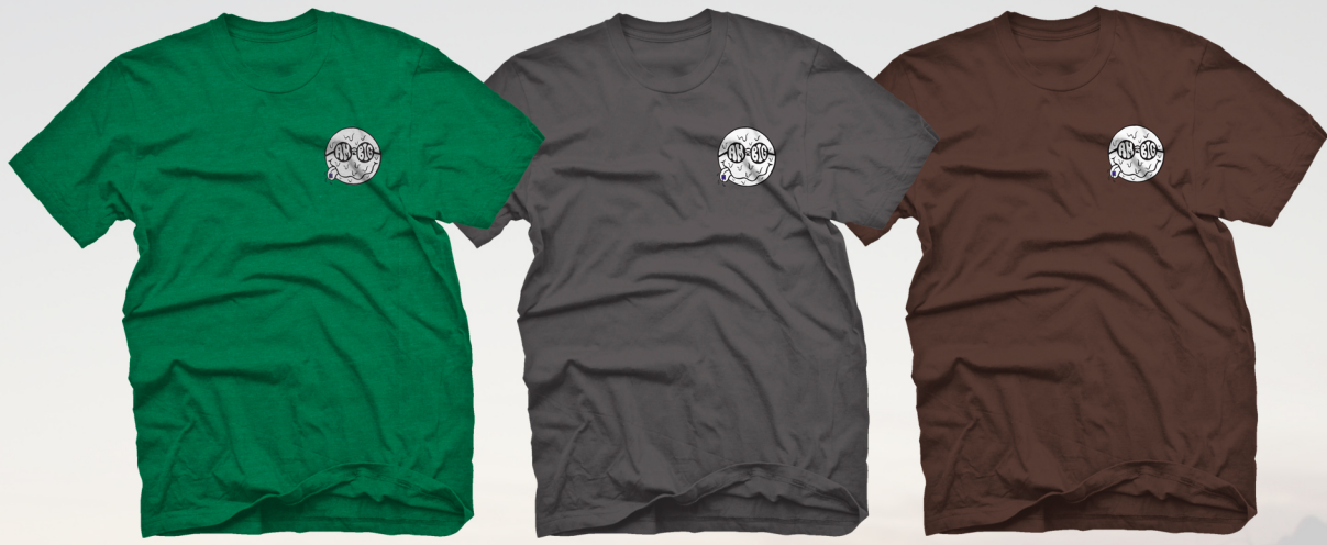
AL1055 TRIPPER KELLY GREEN / CHARCOAL / NEW BROWN $11 / $24