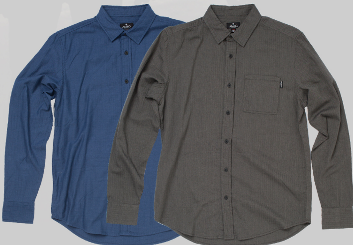
AL1469 LANGE NAVY / GREY HERRINGBONE 100% COTTON $25 / $52