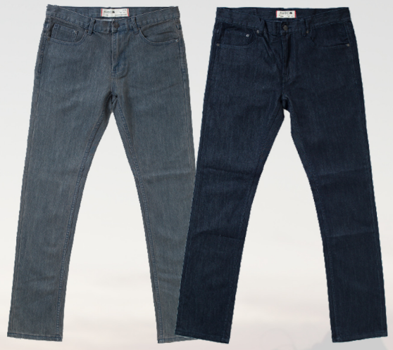
AP1728 MEMPHIS SLIM HARBOR GREY / INDIGO COATED $32 / $66