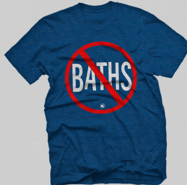
AL2074 NO BATHS ROYAL $8 / $18