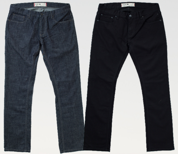
AP1748 CIVILIAN STRAIGHT SATSUMA / BLACK $34 / $70