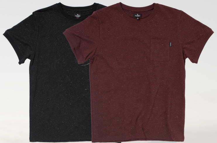
AL1227 KINLEY BLACK / BURGUNDY SPECKLE FRENCH TERRY 60/40 COTTON / POLY $18 / $38