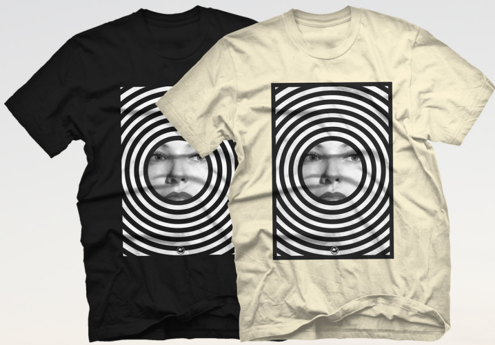
AL1048 SPIRAL BLACK / CREAM $12.50 / $27