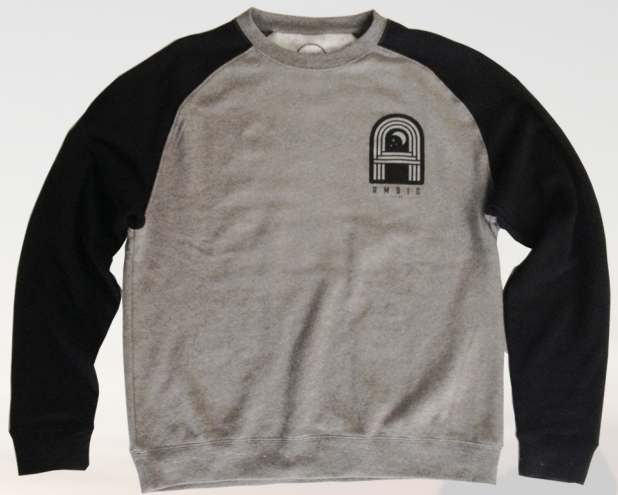
AL1236 MIDNIGHT CREW SWEATSHIRT GUNMETAL HEATHER - BLACK $25 / $52