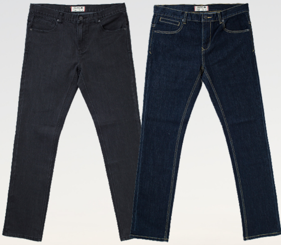
AP1720 PICKENS SLIM FADED BLACK / INDIGO $32 / $66