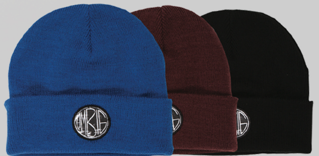
AJ1943 WHATEVER BEANIE BLUE / BURGUNDY / BLACK $9 / $20