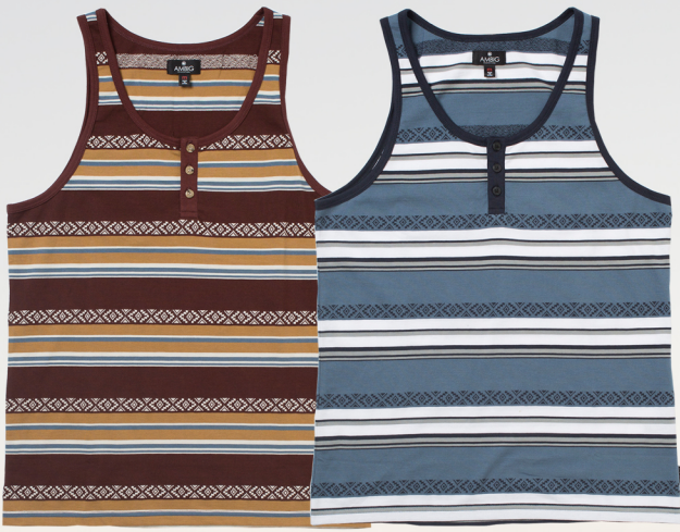
AL1112 KOTA BURGUNDY / BLUE JACQUARD STRIPE 60/40 COTTON / POLY $15 / $32