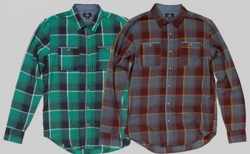
AL1470 CRESTON NAVY / BURGUNDY CVC BRUSHED Y/D PLAID $25 / $52