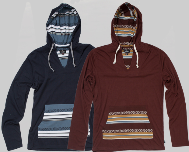
AL1224 HENDERSON NAVY / BURGUNDY JERSEY W/ JACQUARD STRIPE 60/40 COTTON / POLY $23 / $48