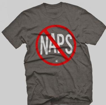
AL2073 NO NAPS CHARCOAL HEATHER $8 / $18