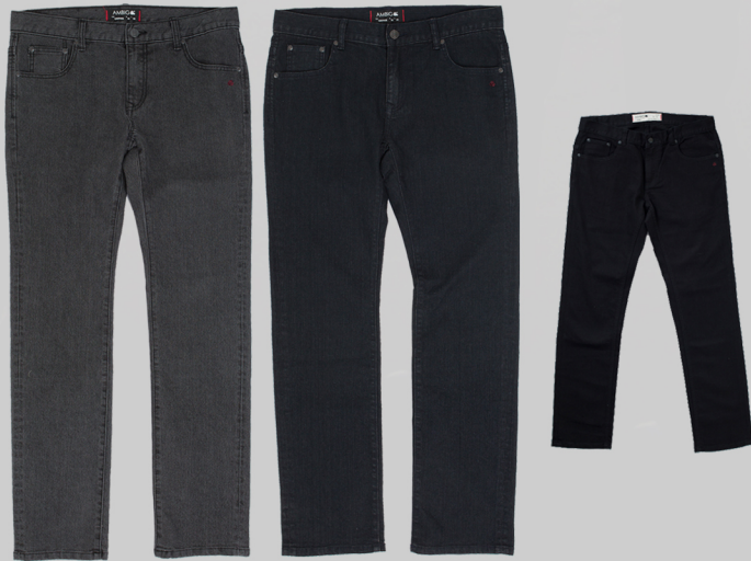
AP1734 BRONX GRIPPER CHARCOAL / MIDNIGHT / BLACK $34 / $70