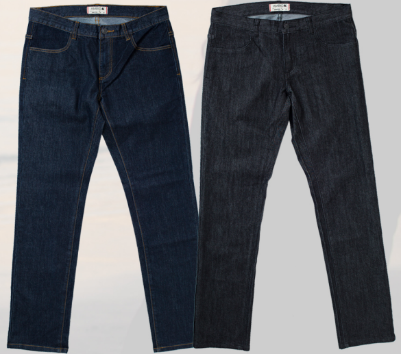
AP1730 DIME STORE GRIPPER INDIGO / BLACK $28 / $58