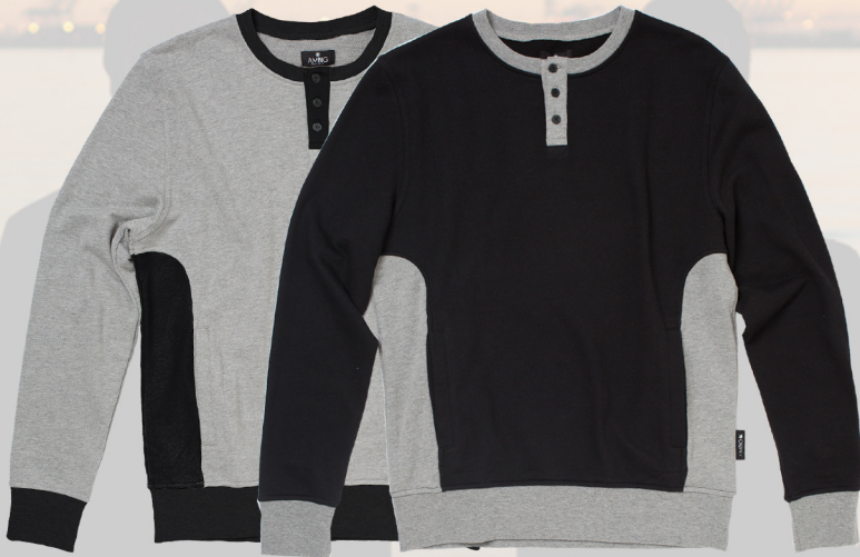
AL1228 GIRARD GREY / BLACK FRENCH TERRY 60/40 COTTON / POLY $28 / $58