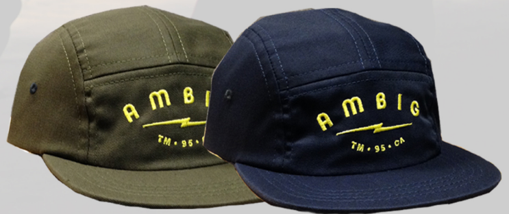
AK9908 LIGHTNING (5 PANEL HAT) OLIVE / NAVY $15 / $32