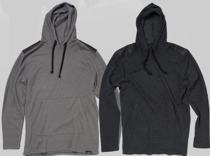
AL1230 BRYANT GREY / BLACK FRENCH TERRY 60/40 COTTON / POLY $27 / $56