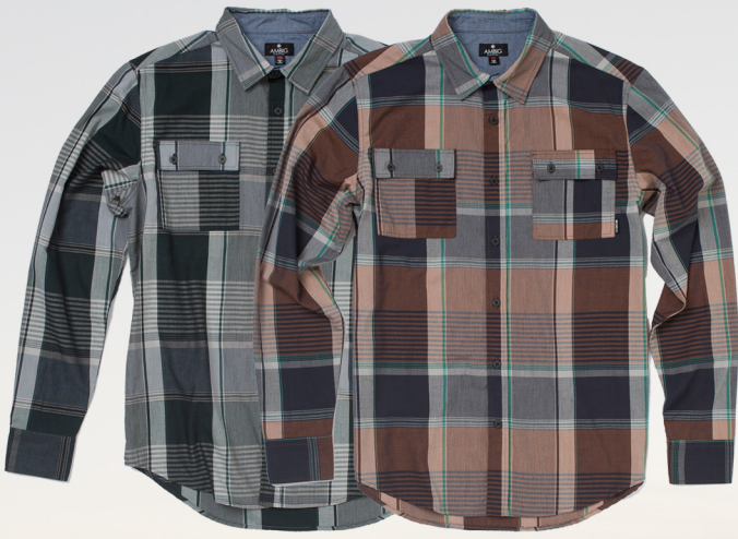
AL1465 OTTO TEAL / NAVY CVC Y/D PLAID $25 / $52