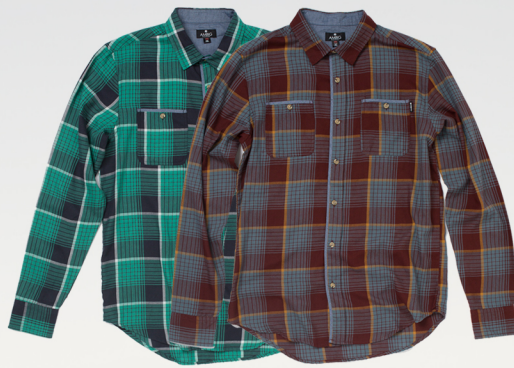
AL2470 CRESTON NAVY / BURGUNDY CVC BRUSHED Y/D PLAID $22 / $44