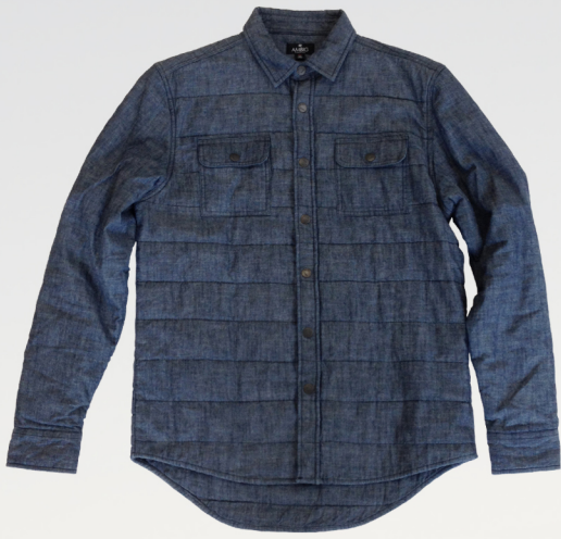
AL1472 COLBY INDIGO QUILTED HEAVY CHAMBRAY 100% COTTON $38 / $78