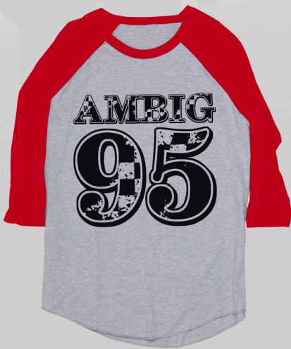
AL1057 RAD RAGLAN HEATHER GREY - RED $15 / $32