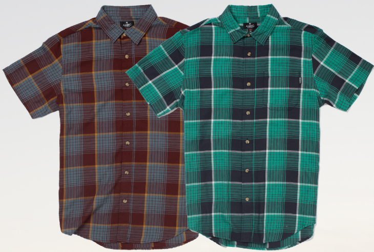
AL1355 CRUZ BURGUNDY / NAVY CVC Y/D PLAID $22 / $46