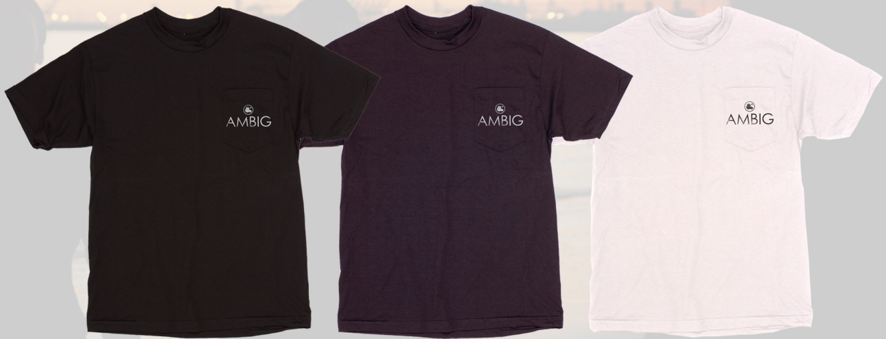
AL1056 LOGO (POCKET TEE) BLACK / CHARCOAL GREY / WHITE $12.50 / $27