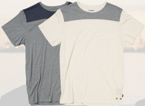
AL2116 AUSTIN GREY / STONE SINGLE DYE JERSEY 60/40 COTTON / POLY $14 / $28