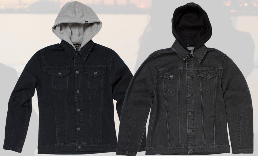
AL1594 MORRIS MIDNIGHT / CHARCOAL DENIM JACKET W/ REMOVABLE FLEECE HOOD $43 / $88