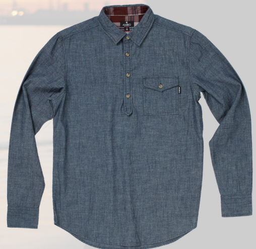
AL1467 BECK INDIGO HEAVY CHAMBRAY 100% COTTON $25 / $52