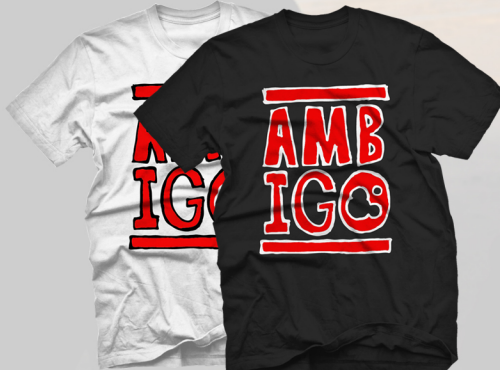
AL2017 STACKED WHITE / BLACK $8 / $18