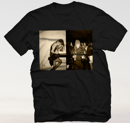
AL1042 GOING STEADY BLACK $12.50 / $27