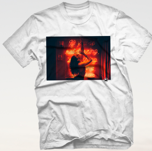
AL1041 DIRTY DANCER WHITE $12.50 / $27