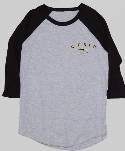
AL1058 BOLT THROWER RAGLAN HEATHER GREY - BLACK $15 / $32