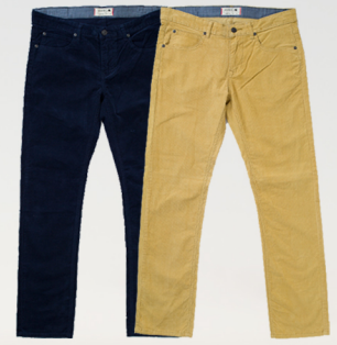
AP1772 WINSTON GRIPPER OLIVE / NAVY / MUSTARD 5 POCKET S/T CORD $32 / $66