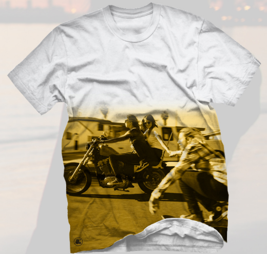
AL1045 OAKLAND WHITE $13 / $28