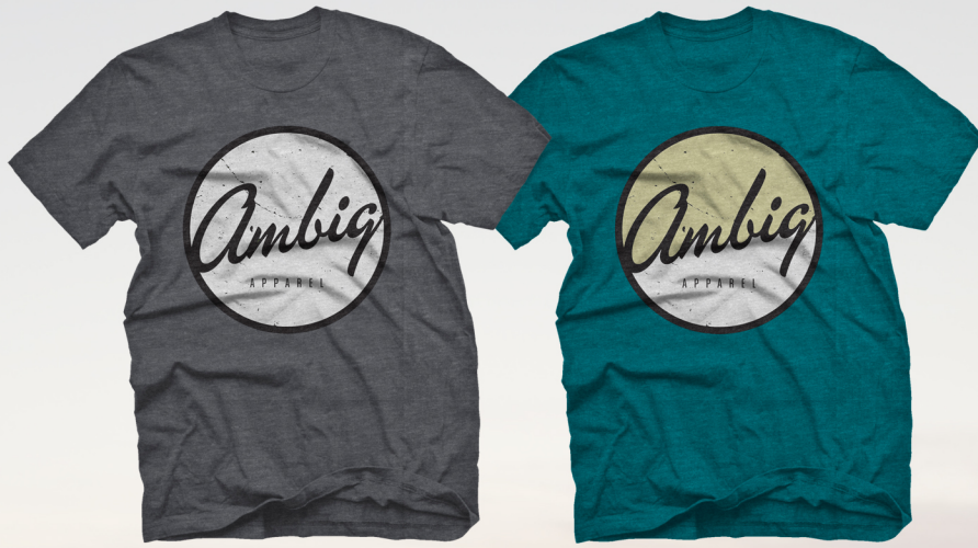
AL1052 CAM SIGNATURE #2 CHARCOAL HEATHER / CYAN BLK HEATHER $11 / $24