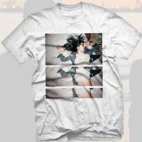
AL1043 FOUR ON THE FLOOR WHITE $12.50 / $27