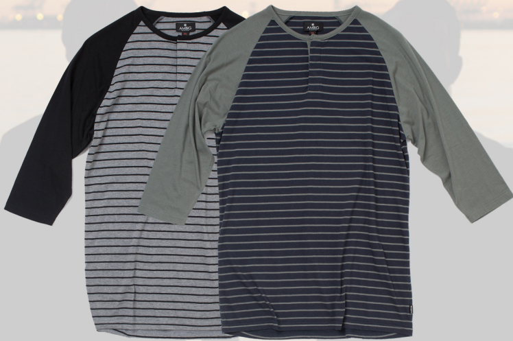
AL1220 LEO GREY / NAVY Y/D STRIPE 60/40 COTTON / POLY $17 / $36