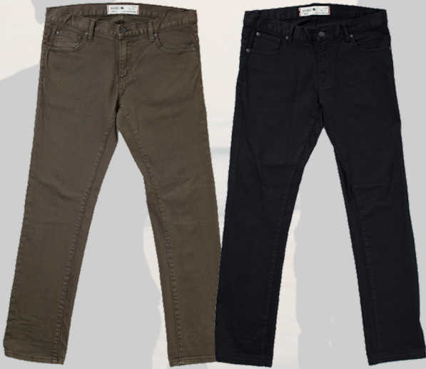
AP1738 RALIEGH GRIPPER DARK OLIVE / BLACK $34 / $70