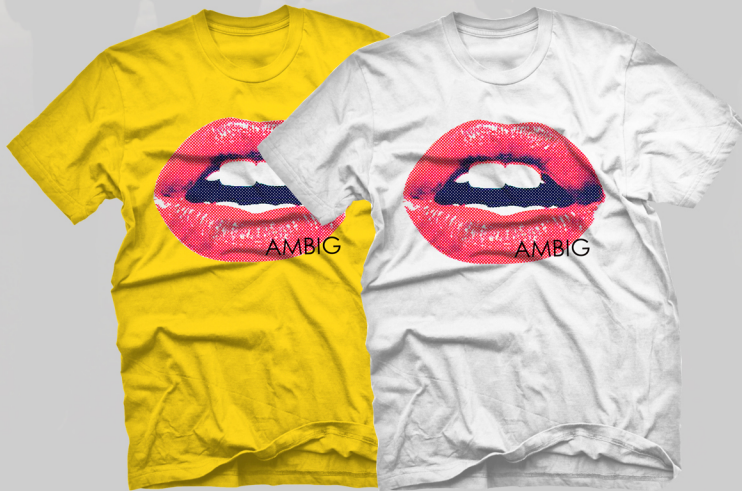
AL1045 LIPSTICK KILLERS YELLOW / WHITE $11 / $24