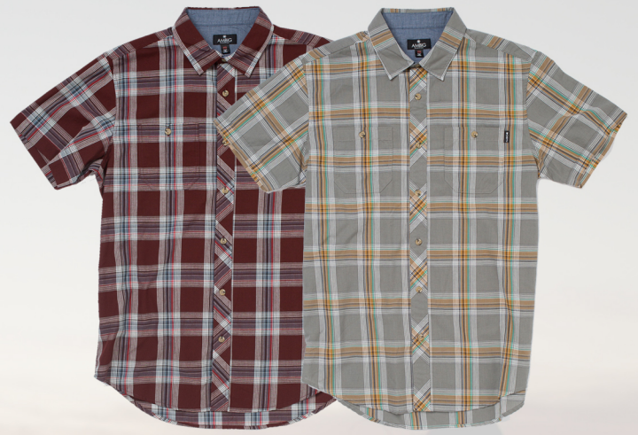
AL1356 THEO BURGUNDY / SAGE CVC Y/D PLAID $22 / $46