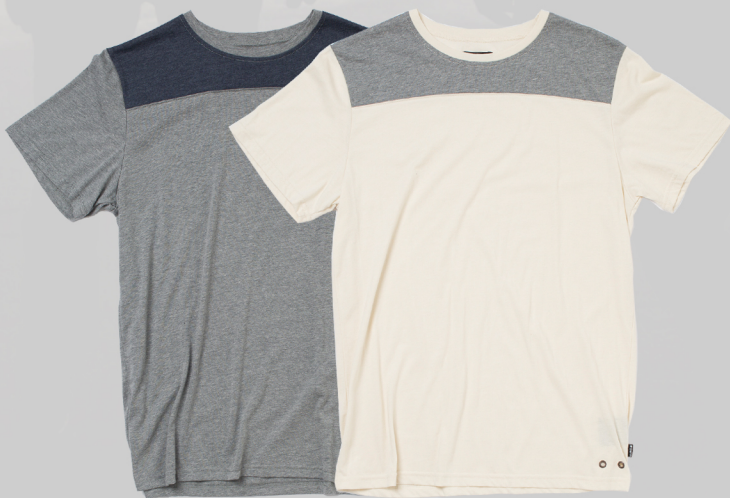
AL1116 AUSTIN GREY / STONE SINGLE DYE JERSEY 60/40 COTTON / POLY $16 / $34