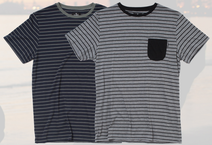
AL1115 EMMETT NAVY / GREY Y/D STRIPE 60/40 COTTON / POLY $16 / $34