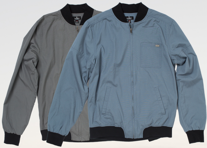
AL1590 FINN GREY / BLUE CANVAS W/ ENZYME WASH 100% COTTON $45 / $92