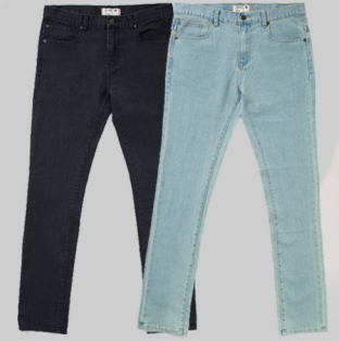
AP1713 ROGUE SKINNY MIDNIGHT / FADED BLK / SUPER LIGHT $30 / $62