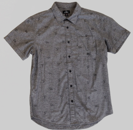
AL1359 GREYSON GREY CVC PRINTED OXFORD $23 / $48