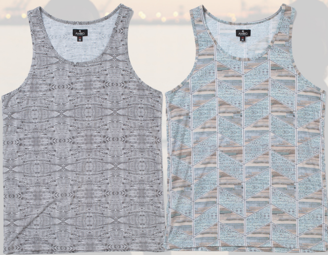
AL1114 KEEFER BLUE / GREY SUBLIMATION 60/40 COTTON / POLY $13 / $28