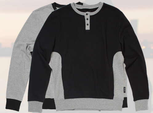
AL2228 GIRARD GREY / BLACK FRENCH TERRY 60/40 COTTON / POLY $25 / $50