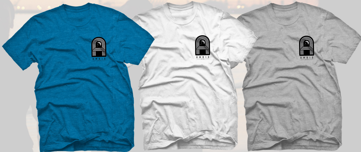
AL1053 MIDNIGHT ROYAL HEATHER / WHITE / HEATHER $11 / $24